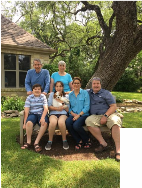
Family Photo Time with Bear!